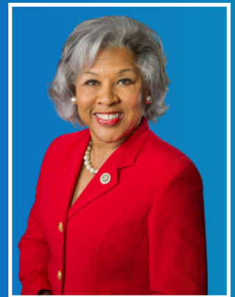
CONGRESSWOMAN JOYCE BEATTY

MANAGING PARTNER & CEO, ASLAND CAPITAL PARTNERS LLC